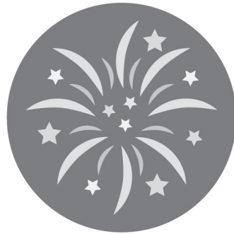
COVER CREDITS Graphic Design by Dan Wood (www.danwoud.com)