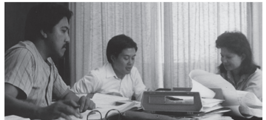
AAJA National archives